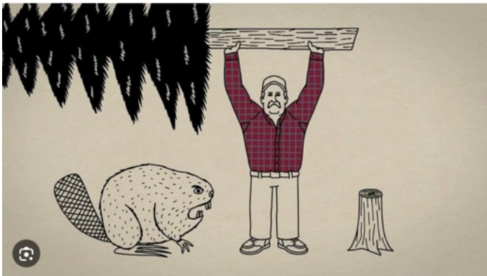
Limberjack - Duluth Trading Co.