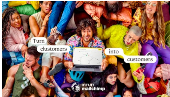
Clustomers - Mailchimp